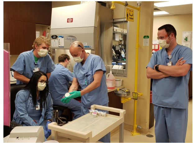
Pathology Department at St. Luke's Magic Valley

There is a lot going on in the lab and while the lab is often a mystery to most, especially during this unique time we are glad to be a vital part of the health care team serving our patients. So next time you see a fellow laboratorian, tell them thanks!