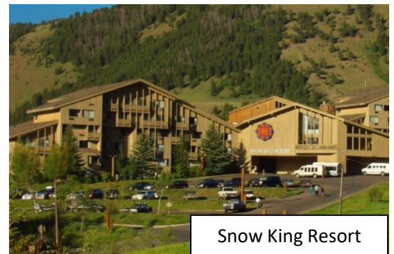
Snow King Resort