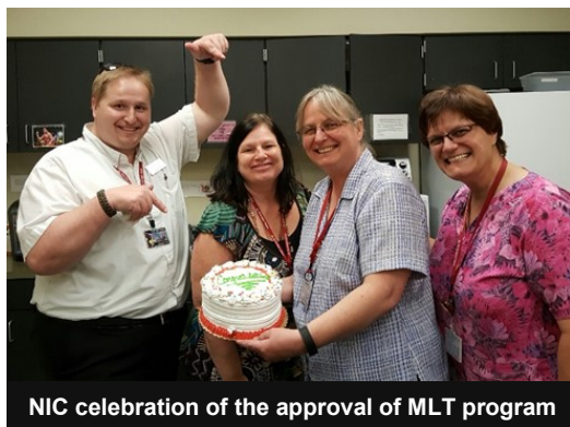
NIC celebration of the approval of MLT program

The program was developed to ensure students have an easy transition to obtain a Bachelor of Science degree and opportunities to obtain higher certification.