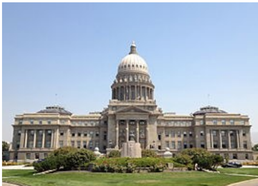
Idaho State Capital