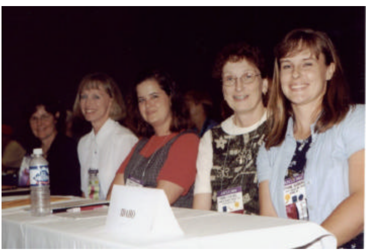
Idaho's Delegates at the House of Delegates in Chicago.